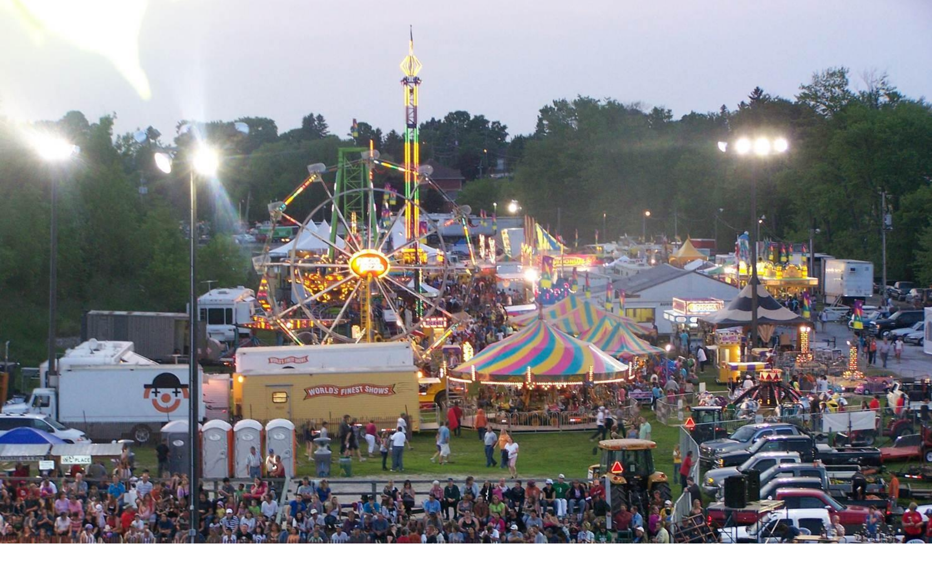
Schomberg Fairgrounds Activation Plan