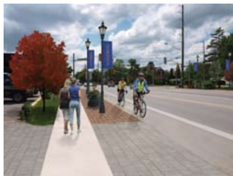
Nobleton streetscape rendering