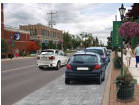
King City streetscape rendering

The Community Improvement Plan for King City, Schomberg and Nobleton is an exciting initiative to promote beautification, property improvements and economic development in the three communities. The Plan was approved by Township Council on September 22, 2014.