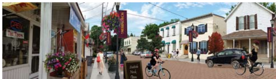
Schomberg streetscape rendering