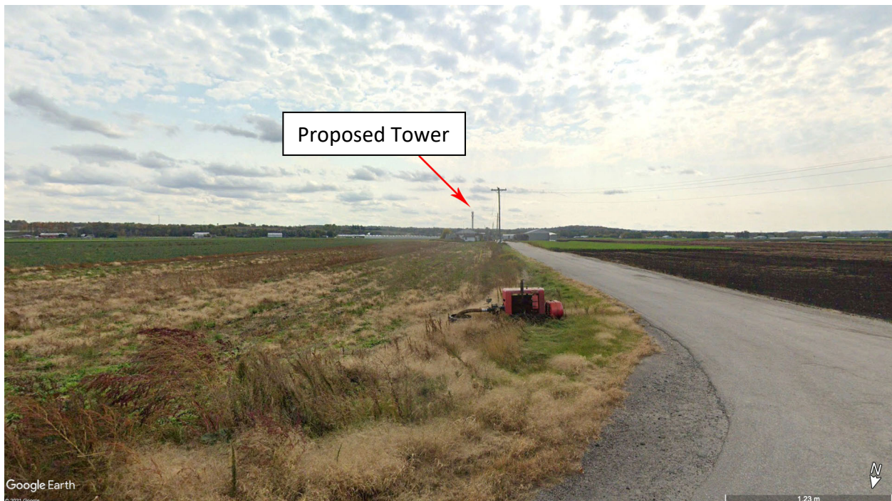
Photo Simulated Image (view from the corner of Hillsvie Rd and Holancin Rd)

Submissions received shall form part of ISEDC's Public Consultation Process under the Spectrum Management and Telecommunications Client Procedures Circular CPC-2-0-03, Issue 5, and may be made public as part of a report issued to interested parties, the Municipality and ISEDC.