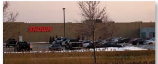
Showa Canada 1 Showa Court