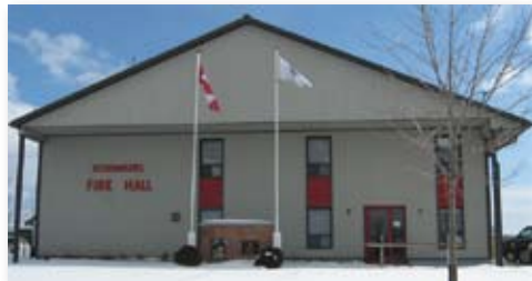
Schomberg Fire & Emergency Station No. 36 91 Proctor Rd.