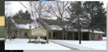
King Township Public Library 77 Main St.