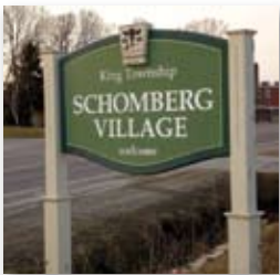
Welcome to Schomberg

Welcome to Schomberg, a community of approximately 2,500 residents, located in the northwest quadrant of the Township. Schomberg enjoys a diverse, balanced economy and lifestyle in a quaint village setting, steeped in tradition. To promote the quaint village atmosphere, local community groups work together in organizing a variety of events held throughout the year.