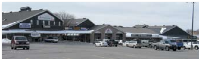
Brownsville Junction Plaza 17250 Hwy 27