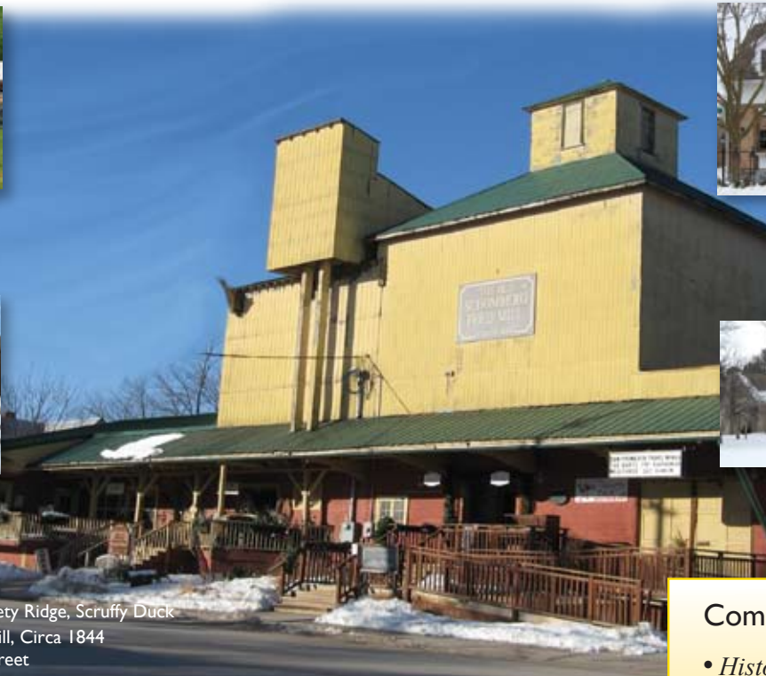
Sheena's, Pretty Ridge, Scruffy Duck Old Feed Mill, Circa 1844 357 Main Street