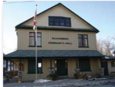
Schomberg Community Hall, Circa 1907 325 Main Street

The event highlight of the year was the annual fair, originally organized in 1851 as a fall event, and moved around the township from year to year. The Fall Fair found its permanent home in Schomberg in 1872. Eighty-five years later, in 1957, the Fall Fair became a Spring Fair, and is held annually during the last weekend in May.