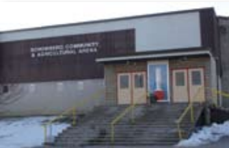
Schomberg Community Arena 251 Western Ave.