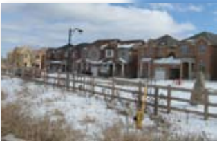
Laurier Homes, Kingsgate Schomberg, Southwest corner of Hwy 27 & Hwy 9