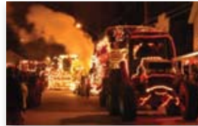
Farmers' Parade of Lights A Main Street Christmas

Another popular outdoor event is A Main Street Christmas , which is held on the 1st Saturday of December. The event boasts an afternoon Santa Claus Parade and an old-fashioned Victorian atmosphere with festive foods and entertainment for young and old, along historic Main Street. The evening is capped off with a spectacular "Farmers' Parade of Lights".