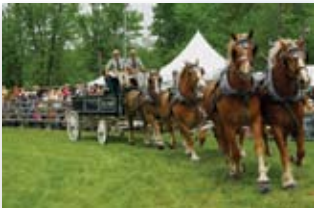
Schomberg Agricultural Fair