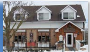
Port Soirée Restaurant Café 174 Main St