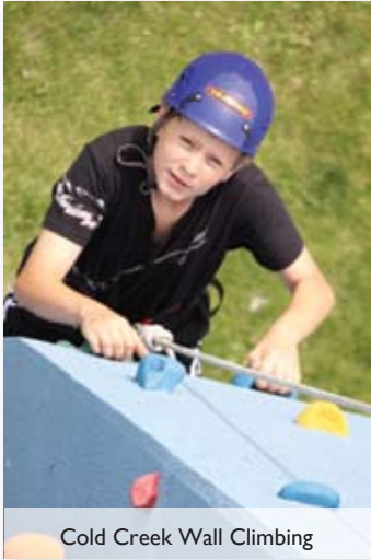
Cold Creek Wall Climbing

Nobleton residents are able to enjoy a number of sporting activities: Baseball, Curling, Golf, Hockey, Skating, Soccer, Swimming, Tennis. The Parks, Recreation and Culture Department of King Township is housed in the Dr. William Lacey Nobleton Community Centre and Arena. It offers a wide variety of programming for all ages throughout the year. To view the Program Guide, visit www.king.ca , click on Departments and follow the link to Parks, Recreation and Culture.