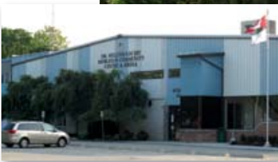
Dr. William Lacey Nobleton Community Centre and Arena 15 Old King Road