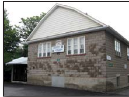
Nobleton Community Hall, Circa 1936 19 Old King Road

For more information on the history of Nobleton, visit www.king.ca and click Library under Community Info; or see www.king.ca/public/heritage.cfm for the King Township museum.