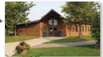
Nobleton Library 8 Sheardown Drive