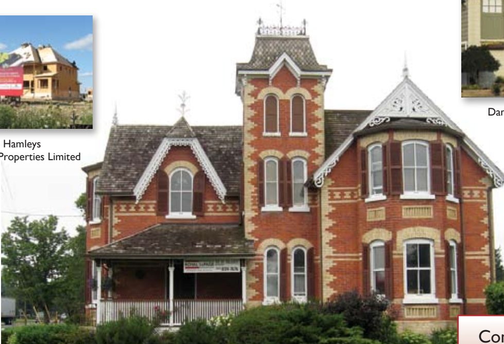
Hamby House, Circa 1884, 6012 King Road