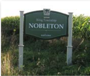
Welcome to Nobleton

Welcome to Nobleton, a rural village of approximately 3100 residents, located in the southwest quadrant of King Township. The community appreciates and celebrates its heritage. Nobleton is moving forward to meet the needs of both residents and business owners.