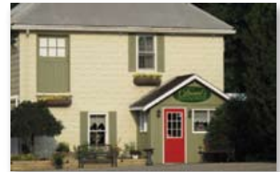
Daniel's of Nobleton, Circa 1936 12926 Hwy 27