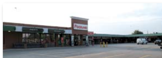
Nobleton Plaza 13305 Hwy 27