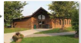
Nobleton Library 8 Sheardown Drive