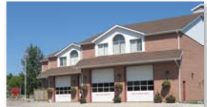
King Fire & Emergency Services, Station 38, 5926 King Road