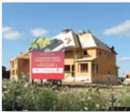
Hamleys Metrus Properties Limited