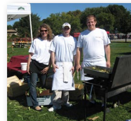
2 nd . Annual King City Corn Roast Rockford's Bar & Grill Staff Wellesley Park, King City

The Maple Leaf Cricket Club was established in 1954 and operates a turf wicket cricket facility. It has hosted international tournaments and draws competitors and visitors from around the globe.