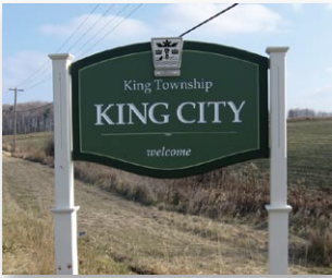
Welcome to King City

Welcome to King City, a community of approximately 5,000 residents, located in the southeast quadrant of the Township. King City, site of the municipal government offices, is home to international, corporate and small business. The village attracts residents seeking to live in a rural community in close proximity to urban amenities.