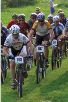
Mountain Bike Trails at King City's Centennial Park

King City Residents are able to enjoy a number of sporting activities: Baseball, Bicycling, Hiking, Hockey, Skating, Soccer, Tennis. The Parks, Recreation and Culture Department of King Township offers a wide variety of programming for all ages throughout the year. To view their program guide, visit www.king.ca and click on departments to follow the link to Parks, Recreation and Culture.