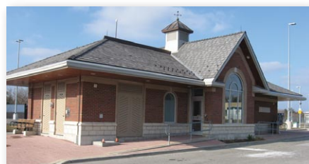
King City GO Train Station 7 Station Rd.