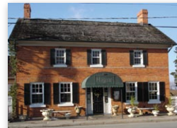
Hogan's Inn at four corners Circa 1855, 12998 Keele St.