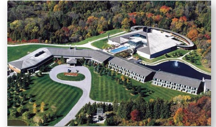
Kingbridge Conference Centre & Institute 12750 Jane St.