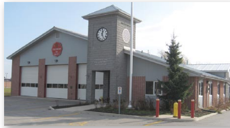
King City Fire & Emergency Station No. 34 2045 King Rd.