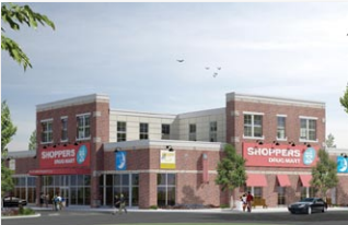
Shoppers Drug Mart 1st LEEDS Shoppers in Canada 2140 King Rd.