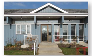
King Township Public Library, King City Branch & Head Office 1170 King Rd.