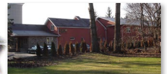
LGL Limited environmental research associates 22 Fisher St.