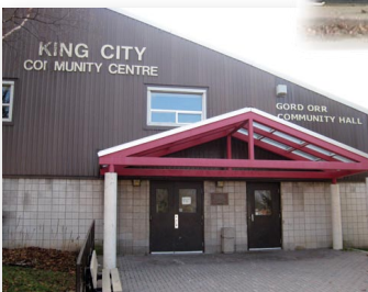
King City Community Centre & Gord Orr Community Hall 25 Doctor's Lane