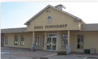
King Township Municipal Offices 2075 King Rd.